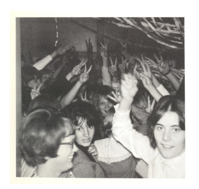
How many girls will fit in the G. R.? In 1970 the answer was 80.

For many women who graduated from Goessel High School the letters G.R. may conjure up memories of a small, narrow, room. A room where only senior girls were allowed, although senior boys often found there way inside.